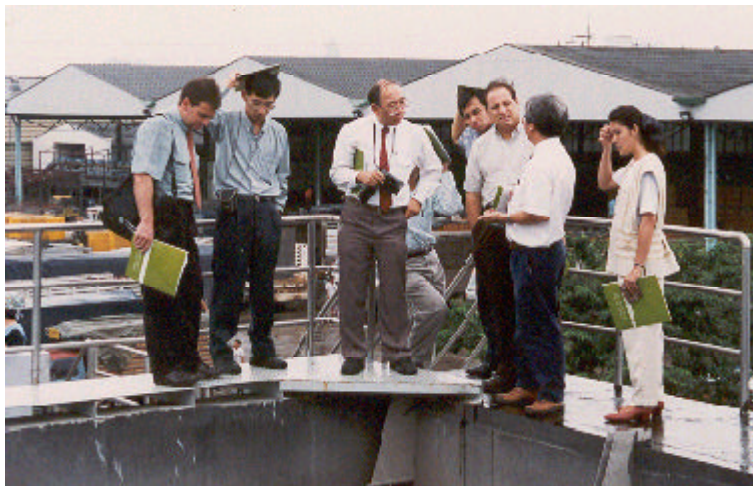
Visit at a Project site in Malaysia