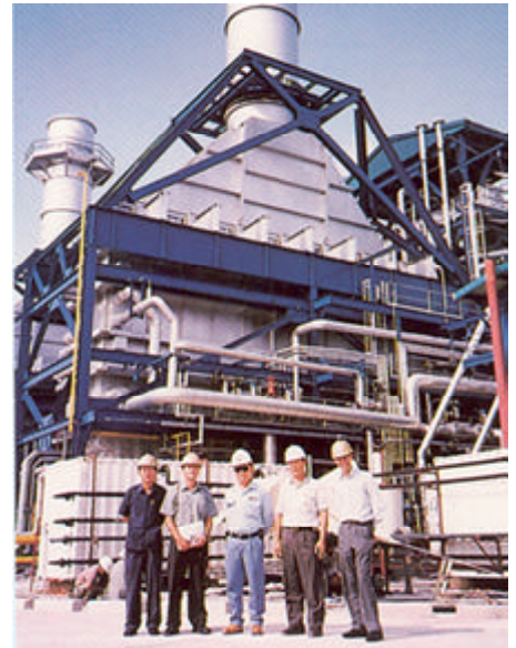
Gas-fired cogeneration in Thailand

COGEN 3 offers a wide range of services to support economic co-operation, including background and market information, business and technical services and support to the implementation of cogeneration projects including Full Scale Demonstration projects (FSDPs).