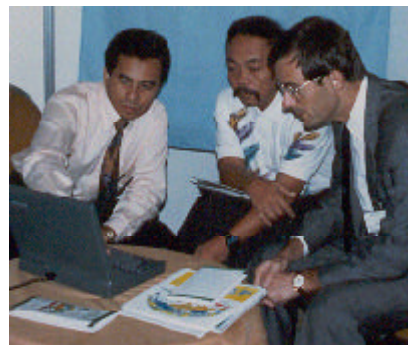
Promoting cogeneration in the Philippines