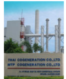
Clean & efficient coal and gas cogeneration plant in Thailand

COGEN 3 also provides advice and assistance on environmental issues related to the development of cogeneration projects. It includes the estimation of Greenhouse Gas (GHG) emission mitigation and Clean Development Mechanism (CDM) aspects.