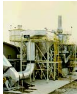
Biomass-fired energy plant in Guthrie MDF, Malaysia

The programme is co-ordinated in ASEAN by the Asian Institute of Technology (AIT) , Bangkok, Thailand and in Europe by Carl Bro International , Sweden. COGEN 3 started its operation in January 2002 and will continue until December 2004.