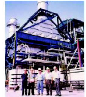
Gas-fired cogeneration, Thailand